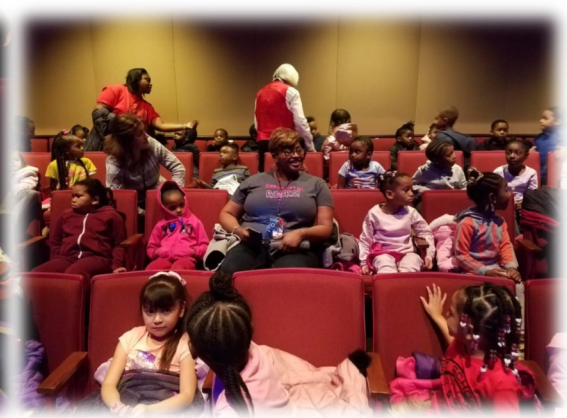
Taft Kindergarten students enjoyed the play Camp Wonderland at The Theater at the Center.